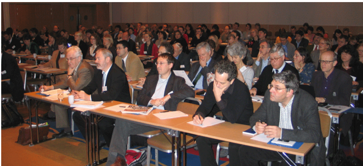
Picture 1: Some 160 participants attended the first day of the conference